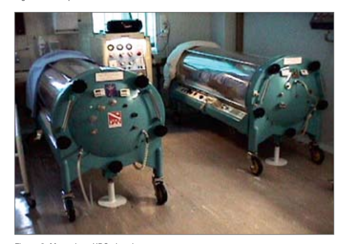
Figure 3: Monoplace HBO chamber

and validates indications with the most up to date literature. UHMS recognizes 13 evidence-based indications for HBO at the present time. ^{25} These are: