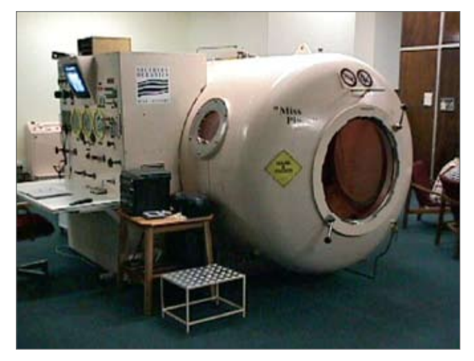
Figure 2: Multiplace HBO chamber

The Southern African Undersea and Hyperbaric Medical Association (SAUHMA) follows the recommendations of the United States based Undersea and Hyperbaric Medical Society (UHMS) with regard to appropriate and ethical indications for the administration of HBO. UHMS is an international peer review and scientific authority of more that 2 500 scientists and clinicians which standardizes therapy